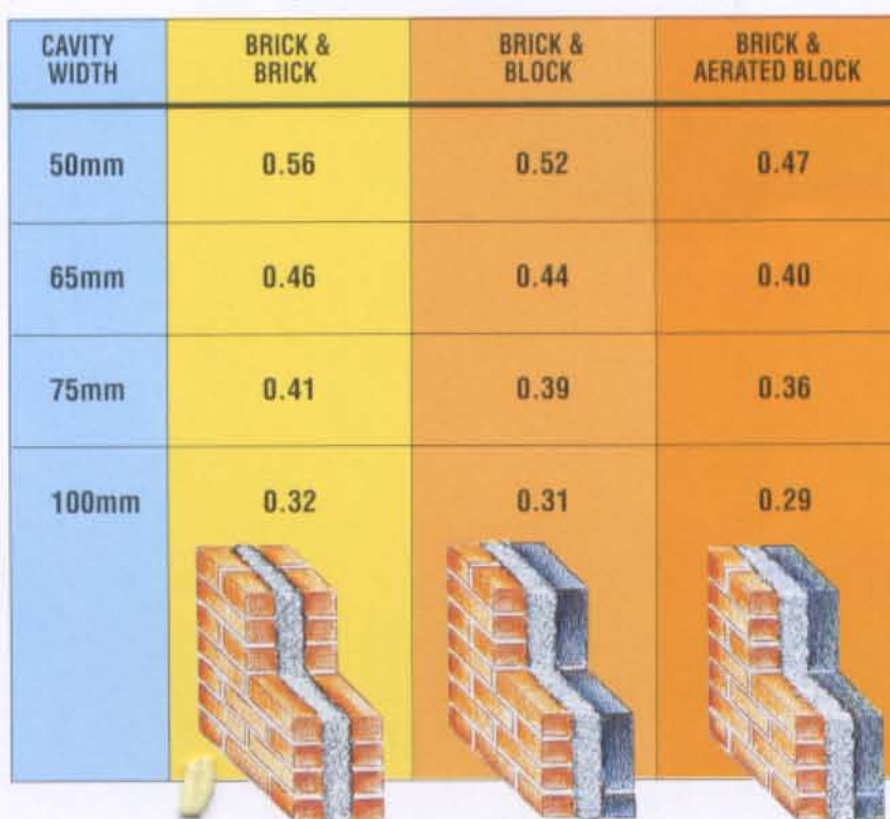
U-VALUES ACHIEVED USING INSTAFIBRE WHITE WOOL (K VALUES OF 0.040 W/mK)

InstaFibre White Wool performs in all weather exposure zones, and will not settle, crack, burn, transmit water or deteriorate with age.